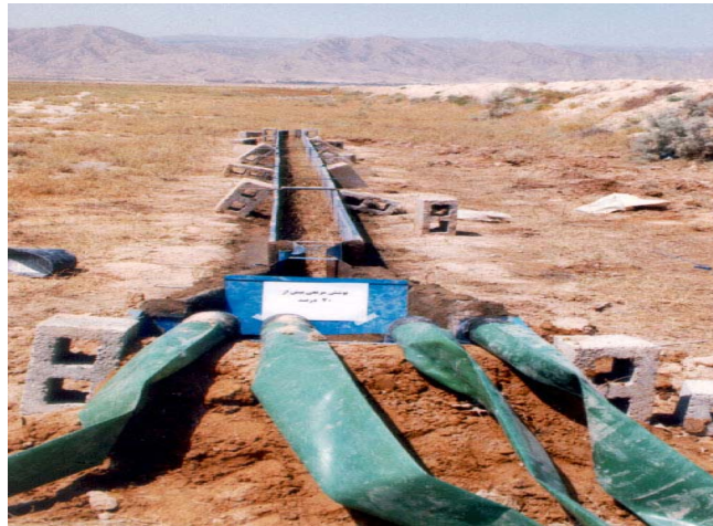
Figure 1. Experimental flume in Lamerd

Critical shear stress for channel incision is higher than that for sheet wash and is set by soil cohesion provided by the root mat. In this study the concentration of flow in spaces between bunches exceeds the threshold for incision and the number of channel head in poor, medium and dense pastures are 8, 5 and 0, respectively (Table 2). This indicates that degradation of vegetation cover has an enormous impact on channel initiation and the extent of channel network.